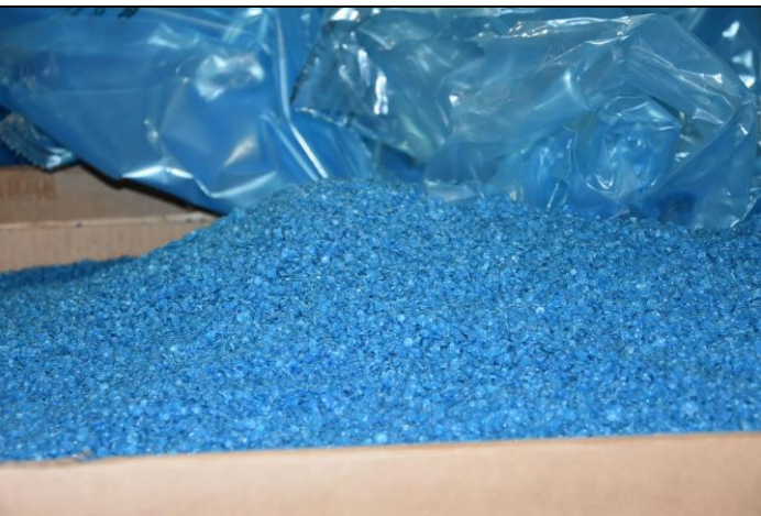
The production process is completed with the waste technology recycling facility which is integral part of the film production process. In EcoCortec® we are able to ensure the purity of the material that returns to the manufacturing process and have completely eliminated disposal of film into the environment.

With state-of-the-art reprocessing equipment EcoCortec® from now on will be reprocessing in house incorporating "repro" back into the virgin film at up to 20 percent so the quality of the new product is ensured. Plastics pollution is one of the leading problems in the world today and our goal is to decrease the amount of waste that is being thrown in the garbage or ends up discarded in environment in order to prevent large amounts of plastics ending up in the landfills.