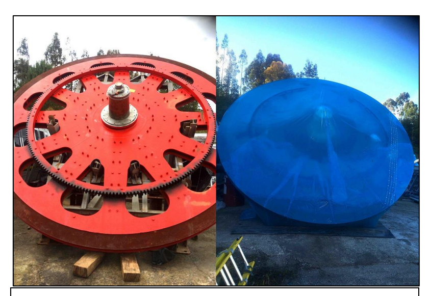
EcoCortec's VpCI® films are used by major global companies worldwide such as General Motors, Toyota, GE, IBM, Volvo Trucks, Mercedes-Benz and many more.

With state-of-the-art reprocessing equipment EcoCortec® from now on will be reprocessing in house incorporating "repro" back into the virgin film at up to 20 percent so the quality of the new product is ensured. Plastics pollution is one of the leading problems in the world today and our goal is to decrease the amount of waste that is being thrown in the garbage or ends up discarded in environment in order to prevent large amounts of plastics ending up in the landfills.